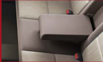
REAR CENTRE ARMREST

Dimensions Length: 3,988 mm Width: 1,620 mm Height: 1,540 mm Wheelbase: 2,450 mm Ground Clearance 165 mm