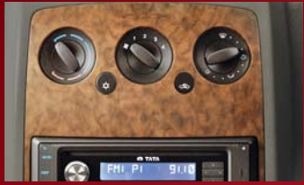
WOODEN CENTRE CONSOLE